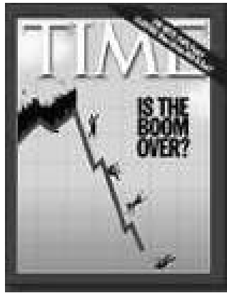
Figure 11: The 1998 Wall of Worry

Further, instead of addressing these myriad economic issues with 100% of his energy, President Bill Clinton was fighting for political survival as Congress considered the report of Independent Council Kenneth Starr. The central issue was whether, after reading Starr’s report, Congressional Democrats would conclude that President Clinton was guilty of impeachable conduct.