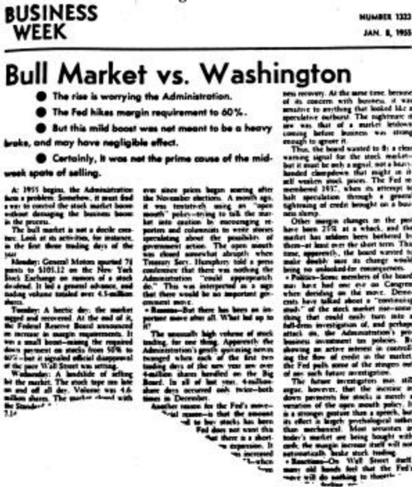
Business Week, January 8, 1955