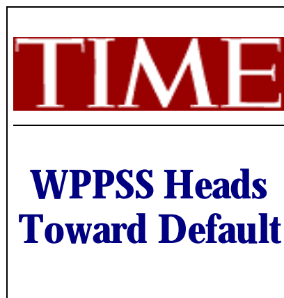
Figure 3: The 1983 “Whoops” Crisis

In the summer of 1983, the U.S. experienced the largest bond default in its history (Figure 3). Washington Public Power Supply Systems stopped making interest payments on $2.25 billion of municipal bonds used to finance the construction of two nuclear power plants. The unprecedented magnitude of the default increased the bond market’s perception of the amount of default risk associated with municipal bonds, particularly those issued by public utilities. As a result, interest rates on municipal bonds, particularly those issued by publicly owned utilities, rose sharply. And the nuclear plant financing catastrophe threatened an economic meltdown in the Pacific Northwest. Today, the California energy crisis seems to threaten both economic and financial turmoil in the state that accounts for one-eighth of U.S. GDP.