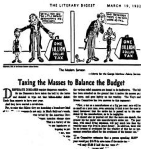
Literary Digest, March 19, 1932