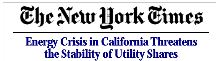
Figure 2: The California Energy Crisis

The center of America’s tech industry is, of course, California, the country’s richest and most populous state. Not only does that state have to deal with the tech slowdown, but it is also confronting an energy crisis, with the two biggest public utilities on the verge of bankruptcy (Figure 2). Today, the Californian Wall of Worry is that, on top of a tech-led recession, the state is also facing a crisis similar to the Washington Public Power Supply Systems (“WPPSS” or, more popularly, “Whoops”) crisis of 1983.