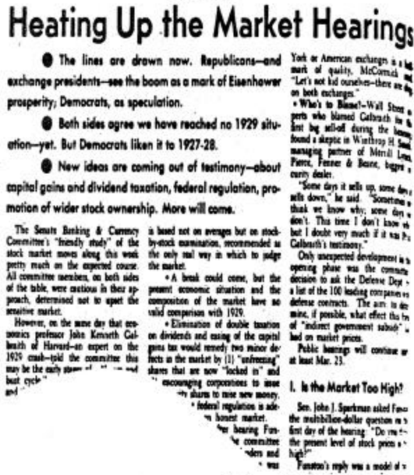
Business Week, March 12, 1955