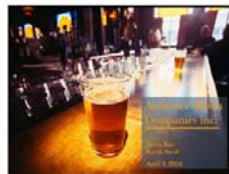
Anheuser Busch Companies (BUD)