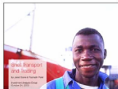
Shell Transport & Trading (SC)