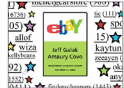
eBay Inc. (EBAY)