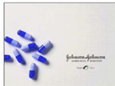
Johnson & Johnson (JNJ)