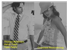
Limited Brands (LTD)