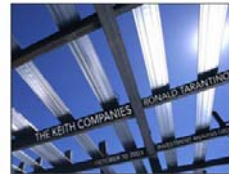
The Keith Compa- nies (TKCI)