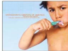
Orthodontic Centers Of America (OCA)