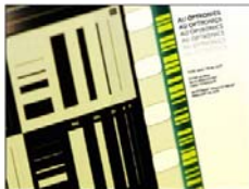
AU Optronics (AUO)