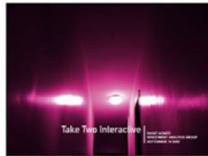
Take Two Interac- tive (TWO)