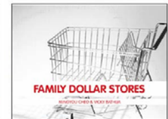
Family Dollar Stores (FDO)