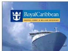
Royal Caribbean (RCL)