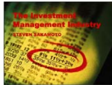
The Investment Man- agement Industry