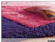
Bed Bath & Beyond (BBBY)