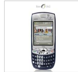
Palm, Inc. (PALM)