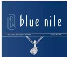
Blue Nile (NILE)