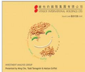
Vitasoy International (VTSYF)