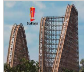
Six Flags (SIX)