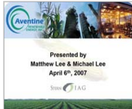
Aventine Renewable Energy (AVR)