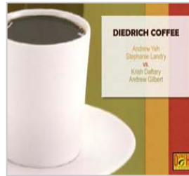
Diedrich Coffee (DDRX)