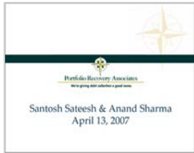
Portfolio Recovery Associates (PRAA)