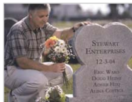
Stewart Enterprise (STEL)