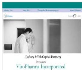
ViroPharma, Inc. (VPHM)