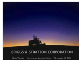
Briggs & Stratton (BGG)