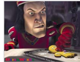
DreamWorks Animation (DWA)