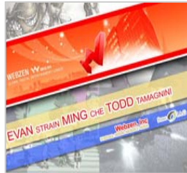
Webzen, Inc. (WZEN)