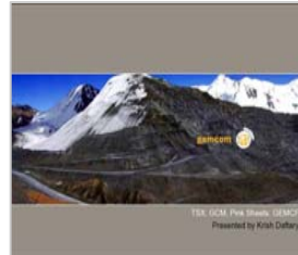
Gemcom Software International (GCM.TO)