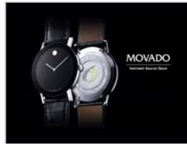
Movado Group (MOV)