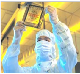
Taiwan Semiconductor (TSM)