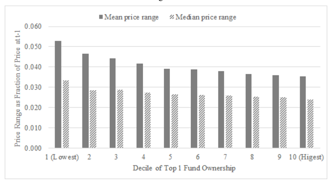
Figure 2. Bond price range by decile of top fund ownership. This figure presents the average monthly bond price range, as a fraction of the price at the end of previous month, by deciles of the top fund ownership. In each month, corporate bonds with available price range data are sorted into deciles by top fund ownership, with decile 1 (10) being the lowest (highest). Panel A includes only investment-grade corporate bonds. Panel B includes only high-yield corporate bonds. Solid gray bars represent the means. Patterned gray bars represent the medians. Detailed variable definitions are in the Appendix.